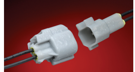
1-by-2 Cable-Sealed Connection System

Optional connector position assurance (CPA) and clip slot features are offered to increase connector-to-connector and connector-to-vehicle retention during use. The MX150 cable-sealed connection system complements Molex's extensive MX150 product line. For additional information about this product visit: www.molex.com/ind/mx150.html .